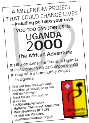
The ad that started it all Scouting Magazine Sep 98.